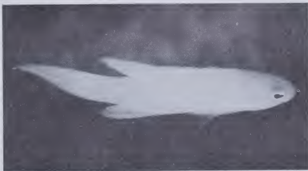
Fig. 5. Assessor flavissimus , approximately 35 mm SL, photographed in 12 metres at Spur Reef, Queensland (photo inverted).